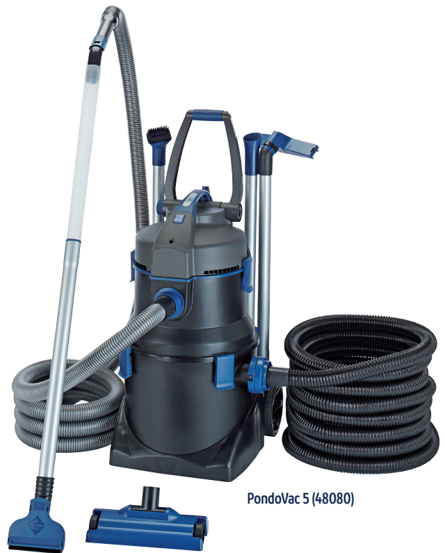
PondoVac 5 (48080)

Larger wheels (6") ensure stable movement through rough terrain as well as low-noise when in operation.